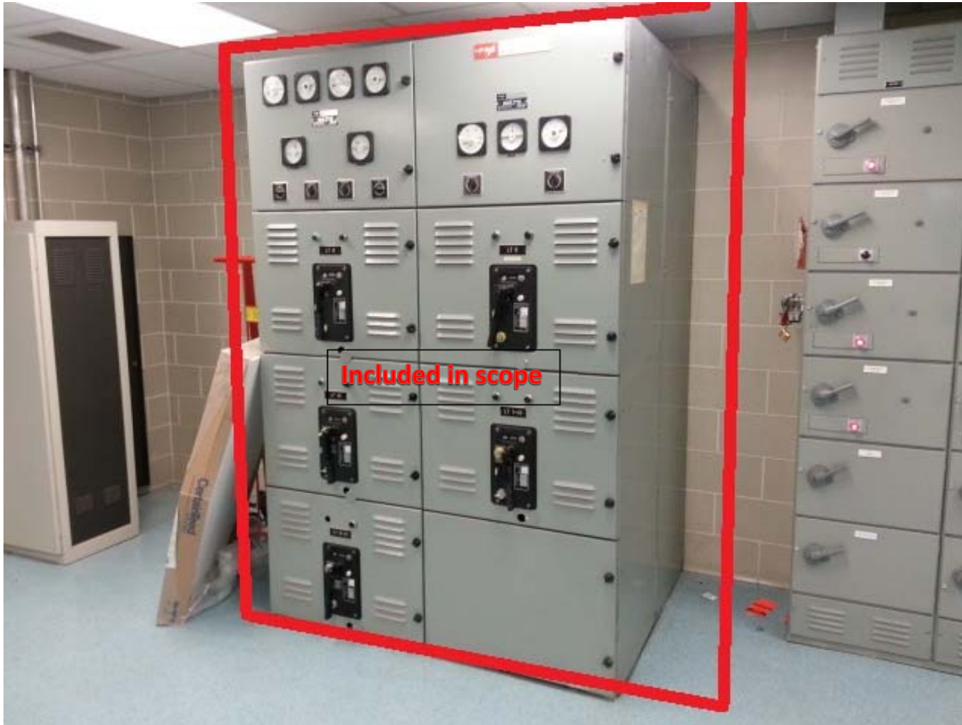
Figure 3 - 1960's Secondary Clarifiers Drawout Air Circuit Breakers