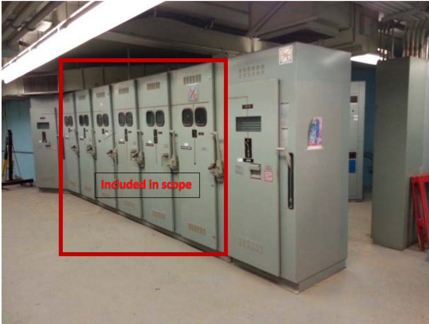
Figure 4 - 1960's Digester East Non-Drawout Disconnect Switches