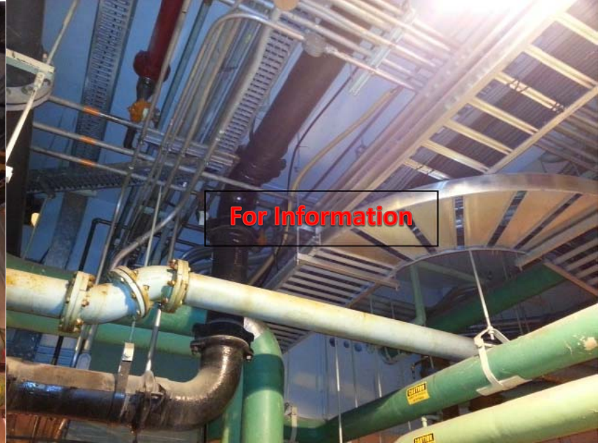
Figure 6 – Underneath the Digester East Electrical Distribution Room